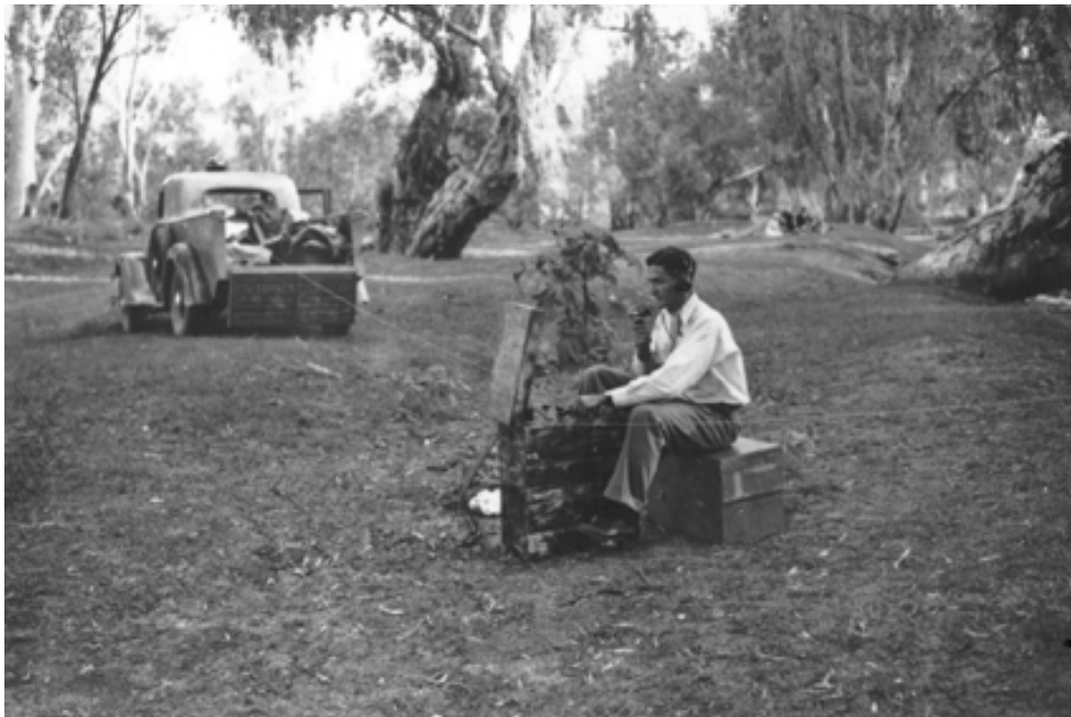
Operating portable pedal wireless set in the outback.