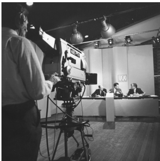
Experts analyse progressive voting returns during a direct telecast from the national tally room in Canberra. NAA: C1748, L67789