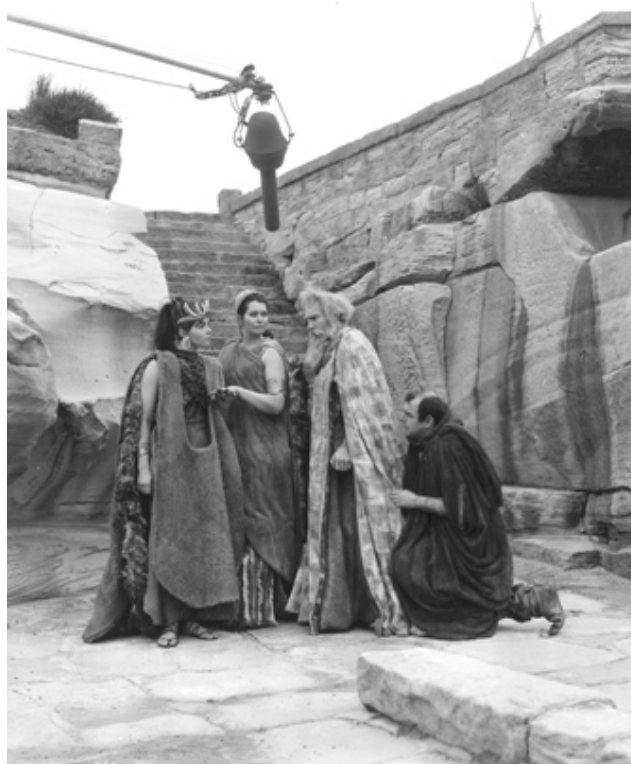
An ABC team records a schools production of King Lear on the cliffs at Bondi. NAA: C1748, L72204