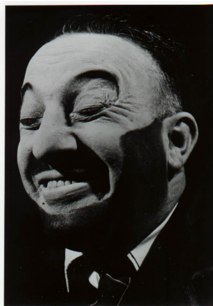
Roy Rene (Mo), 1930.

This series consists of sound/audio tapes, reel-to-reel audio tapes and VHS tape used in the production of the ABC Television quiz program 'University Challenge', 1988-89.