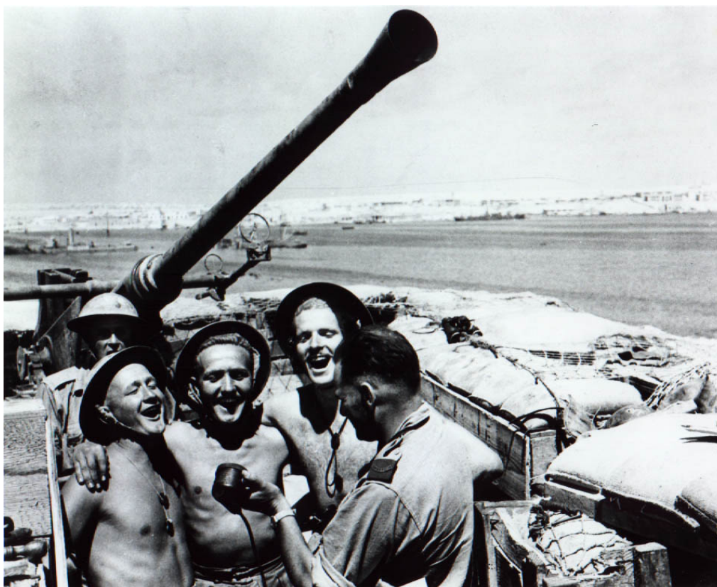
ABC field unit – Scottish trio sing for ABC radio correspondent Chester Wilmot, c1941. NAA: SP312/1, 3

This series consists of 34 reel-to-reel tape recordings of parliamentary excerpts taped by Alan Reid of the ABC newsroom. These excerpts mainly cover parliamentary question time and are the only parliamentary sound recordings held by the ABC. The recordings were discontinued when Alan Reid moved to another area of the newsroom.