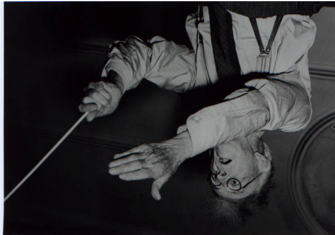
Australian conductor Alfred Hill, c1958. NAA: SP1011/1, 2432