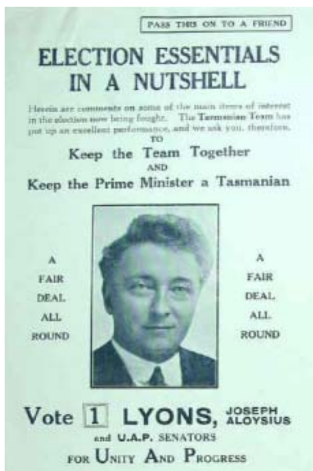
Pamphlet from the 1934 Federal election campaign. NAA: CP30/3, 78

The correspondence series most relevant to Lyons were generally created by various Commonwealth agencies and are held in the Canberra, Sydney and Melbourne offices of the National Archives.