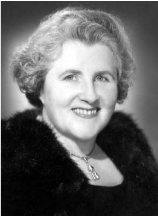
Enid Lyons, politician, nd.