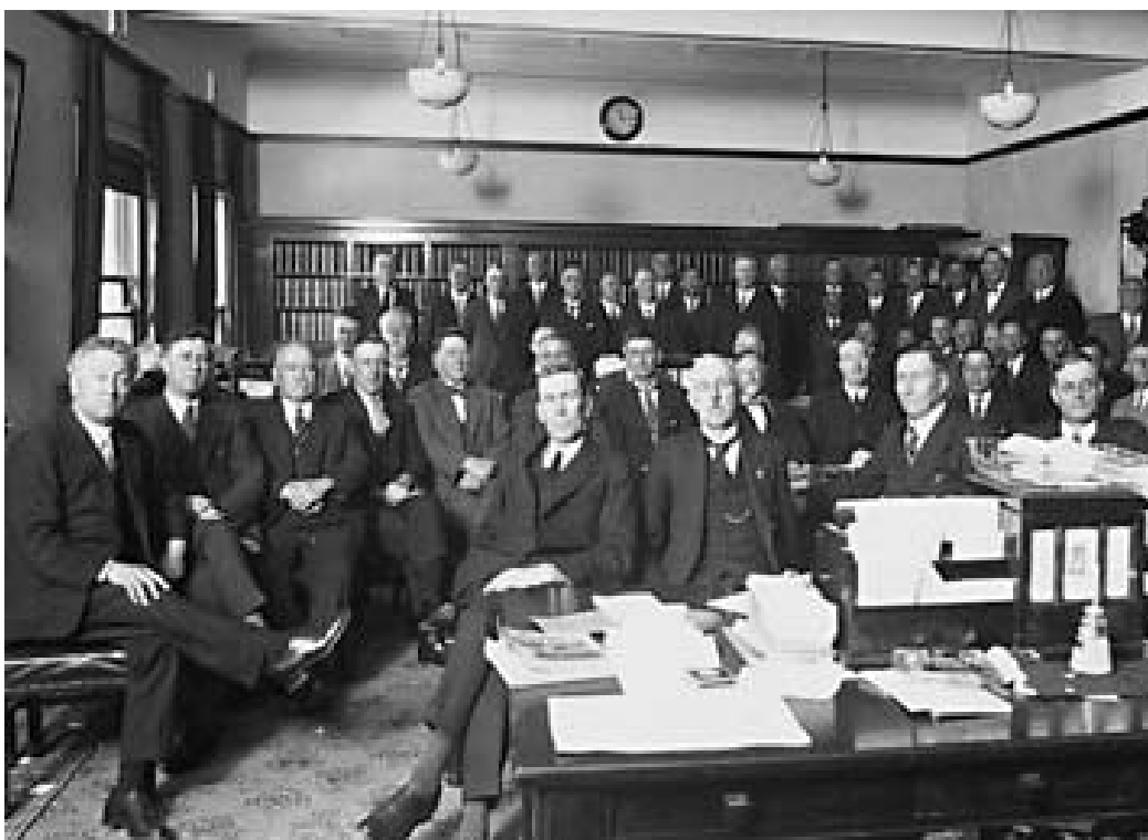
Members of the Scullin Ministry, with Lyons seated at front left, 1929. NAA: A3560, 6120

The UAP formed a government with Lyons as Prime Minister on 6 January 1932. He was also Treasurer from January 1932 until 3 October 1935, when he was succeeded by Richard Gardiner Casey, and Minister for Commerce from 3 to 13 October 1932. He became a member of the Privy Council in 1932. After the 1934 elections the UAP formed a coalition Government with the Country Party, retaining Lyons as Prime Minister.