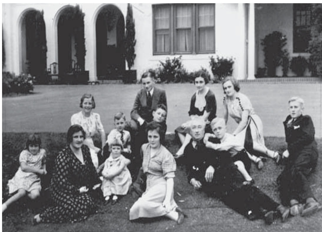
Prime Minister Lyons, Dame Enid Lyons and their family on the lawn at The Lodge, Canberra, nd. NLA Pic 06

The collection consists mainly of correspondence, but also holds photographs, newspaper cuttings, speeches, broadcasts, manuscripts of Dame Enid's books So We Take Comfort , The Old Haggis and Among the Carrion Crows , invitations and programs. The correspondence consists largely of condolence letters following J A Lyons' death in 1939. The remaining letters are from politicians, Tasmanian friends, women's groups, religious organisations, and the Liberal Party. This material covers topics such as maternal and infant welfare, social services and abortion law reform.