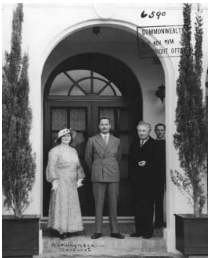
HRH Prince Henry with Prime Minister Lyons and Mrs Lyons, Canberra, 1934. NAA: A1861, 6590

This photograph is of Prime Minister Joseph Lyons and the Governor-General, Sir Isaac Isaacs, along with members of the Executive Council.