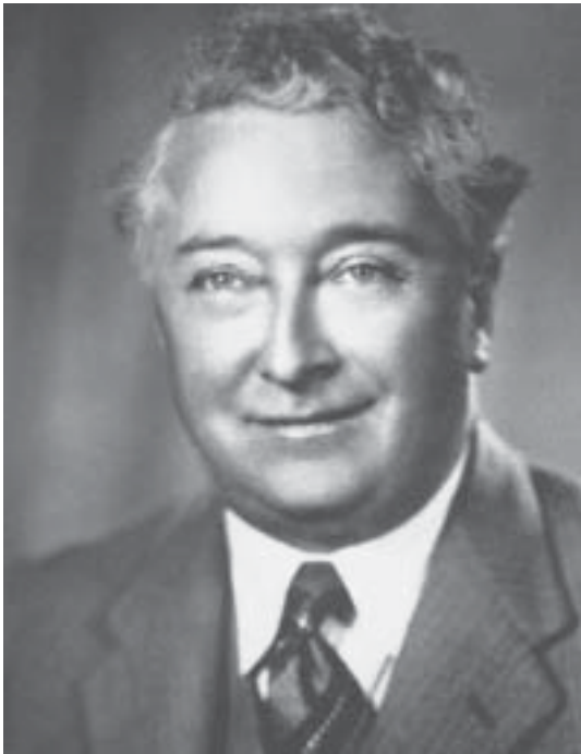
Joseph Lyons, 1932–39.

Joseph Aloysius Lyons (1879–1939) was a prime minister with an unusual record. He was one of only two State premiers who became Prime Minister (the other was Sir George Houstoun Reid), and the only Tasmanian. He was the first to win three successive elections, and was one of the longest-serving as well as one of the most popular prime ministers in the nation's first century.