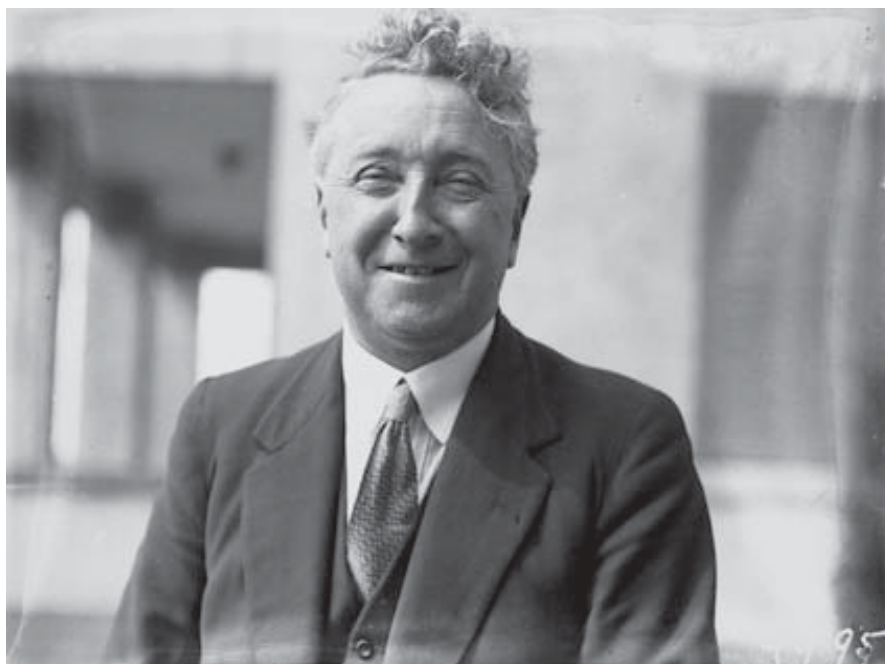
J A Lyons, pictured at the opening of the 16th Parliament, 1929.

Apart from Lyons' own records, many other records relating to him were created by government departments and agencies during his terms of office as a minister in various portfolios and as Prime Minister. These Commonwealth records, held at the National Archives, reveal the political context of Commonwealth Government activities and the processes of government decision-making and administration. They consist mainly of general policy and correspondence files and refer to the everyday implementation of government policy.