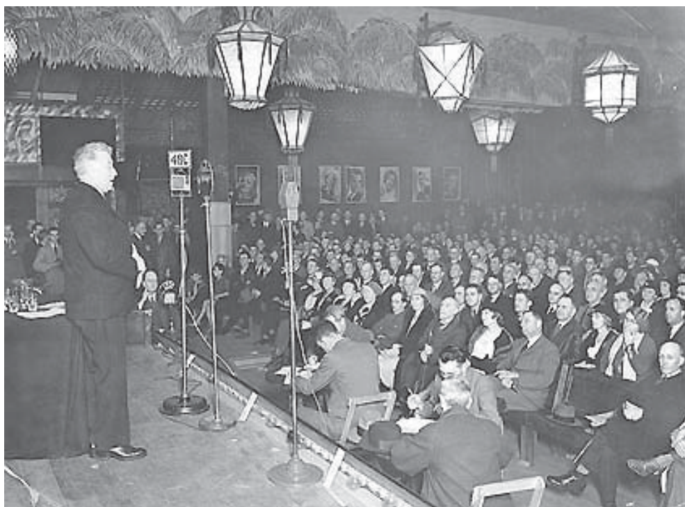
Prime Minister Lyons addressing a crowd in Brisbane, 1934.