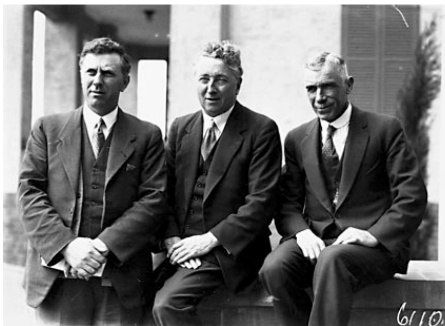
Hon. Joseph Lyons (centre) and two other members of Federal Parliament, 21 October 1929.

In the fraught economic circumstances of 1931, Lyons' confrontation with his Prime Minister and his resignation and departure from the ALP were not the only internal problems facing the Government. More prominent was its dispute with 'Lang Labor', a splinter group of supporters of New South Wales Premier Jack Lang that had formed in Canberra and gained the balance of power in the House of Representatives. This conflict gave Lyons the opportunity to win government within the year. In March, Premier Lang defaulted on interest payments due on loans raised in London by the New South Wales Government. The Commonwealth Government was forced to pay the amounts and began legal proceedings against New South Wales to recover the money. In November 1931, Lang Labor voted with the Opposition (including the UAP) in a no-confidence motion and the Scullin Government was defeated. Parliament was dissolved and Labor suffered a decisive defeat by the UAP, led by Lyons, at the ensuing election in December 1931.