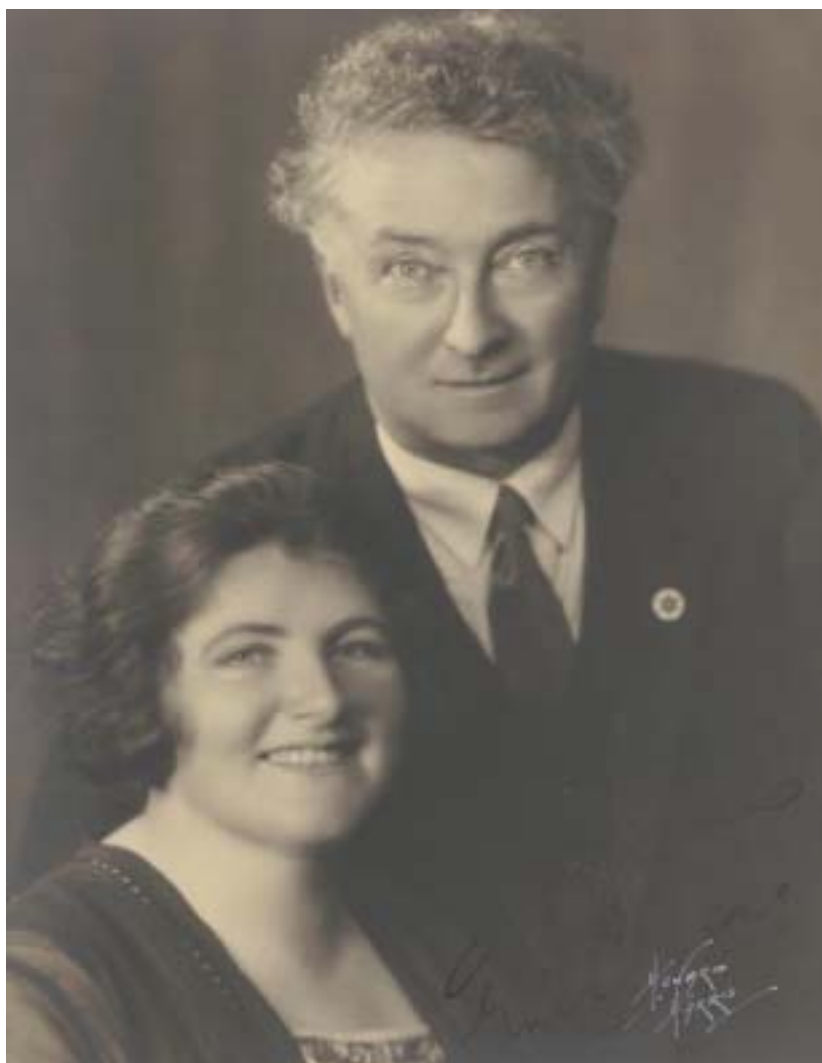
Portrait of Joseph and Enid Lyons, c1933.

Dame Enid was affectionately known as 'Australia's Greatest Mother'. She was created a Dame Grand Cross of the Order of the British Empire (GBE) in 1937, an honour conferred personally by His Majesty King George VI, and a Dame within the Order of Australia (AD) in 1980. She was also an Honorary Fellow of the Australian College of Nursing. She died in Ulverstone on 2 September 1981 and is buried beside her husband in Devonport.