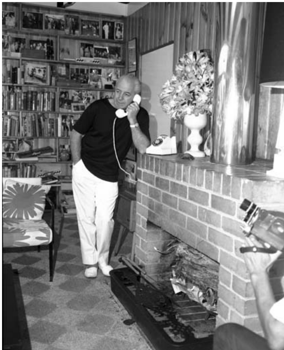
Harold Holt converses on the telephone at Portsea, Victoria, 1966.