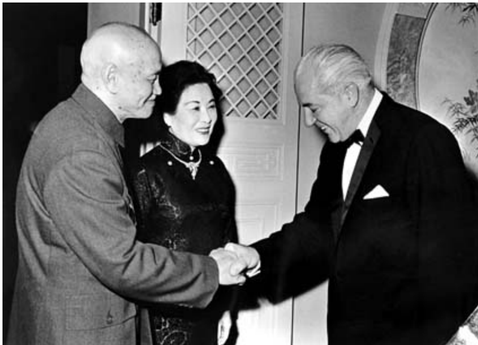
Prime Minister Harold Holt greeting Chiang Kai-shek and Madame Chiang, 1967.