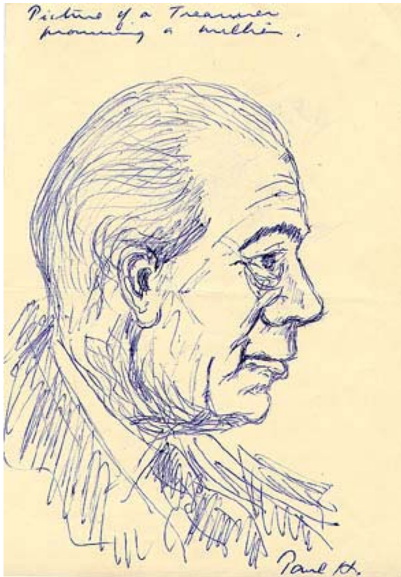
Pen sketch of Harold Edward Holt by Paul Hasluck, 1959.

CORRESPONDENCE FILES MAINTAINED BY HAROLD EDWARD HOLT, 1959-67