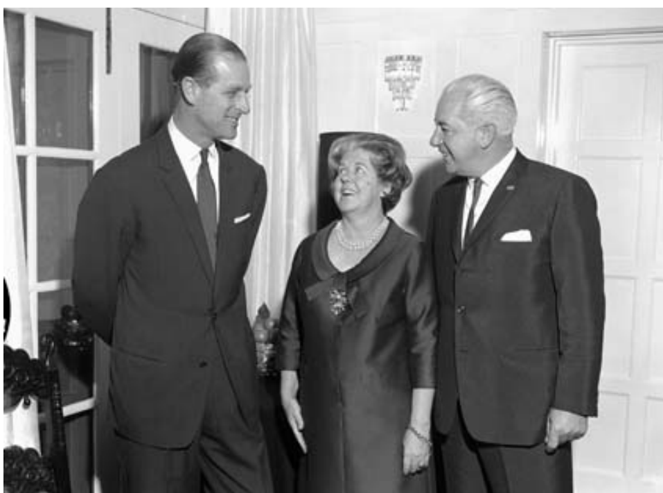
The Duke of Edinburgh with the Holts at The Lodge, 6 March 1967. NAA: A1200, L60989

This series consists of folders of papers arranged under subject headings which relate to the Press Secretary's activities, prime ministerial correspondence and briefings, visits and arrangements, as well as other issues of the period.