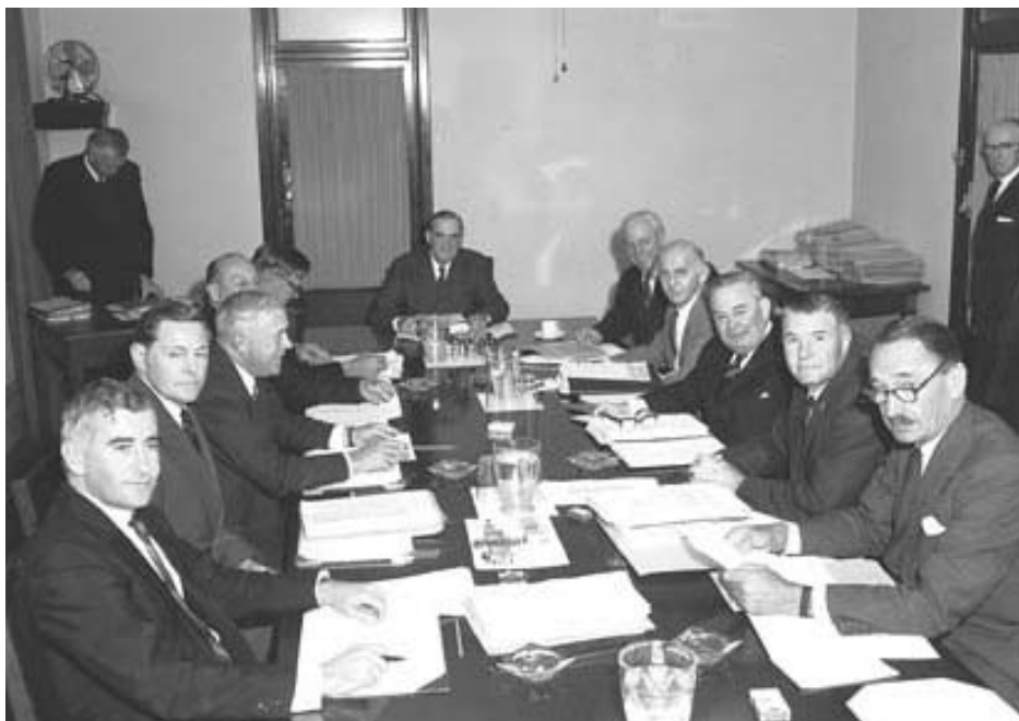
Meeting of Federal Cabinet Ministers in Sydney, 24 June 1965. (Clockwise from left): Billy Snedden (Attorney-General), David Fairbairn (National Development), Allen Hulme (Postmaster-General), Allan Fairhall (Supply), Charles Aderman (Primary Industry), John McEwen (Acting PM), Harold Holt (Treasurer), William McMahon (Labour and National Service), Senator Shane Paltridge (Defence), Gordon Freeth (Shipping and Transport) and Charles Barnes (Territories).

After the 1958 election returned the Menzies–McEwen Coalition, the new ministry saw Holt succeed Fadden as Treasurer, while continuing as Deputy Leader of the Liberal Party and Leader of the House. He held the position of Treasurer until 26 January 1966 when he was elected as Prime Minister.