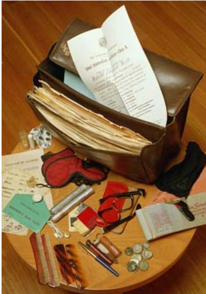
The contents of the briefcase Harold Holt took to Portsea on the day he disappeared.

5-shekel silver coin in a small brown wooden presentation case.