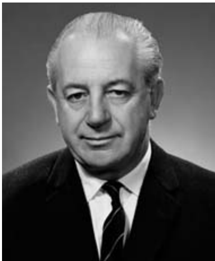
Harold Holt, 1965.

Many Australians remember Harold Holt most for the drama and mystery of his death. He is also remembered for his enthusiastic support for US President Lyndon Johnson's prosecution of the Vietnam War. But in his 32 hardworking years in Parliament – 24 of them on the government benches – Holt made a solid contribution to Australia's social and economic development as a Minister, Treasurer and Prime Minister.