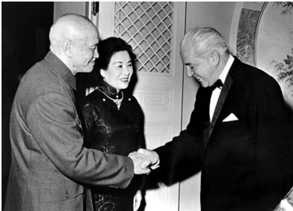
Prime Minister Harold Holt greeting Chiang Kai-shek and Madame Chiang, 1967.