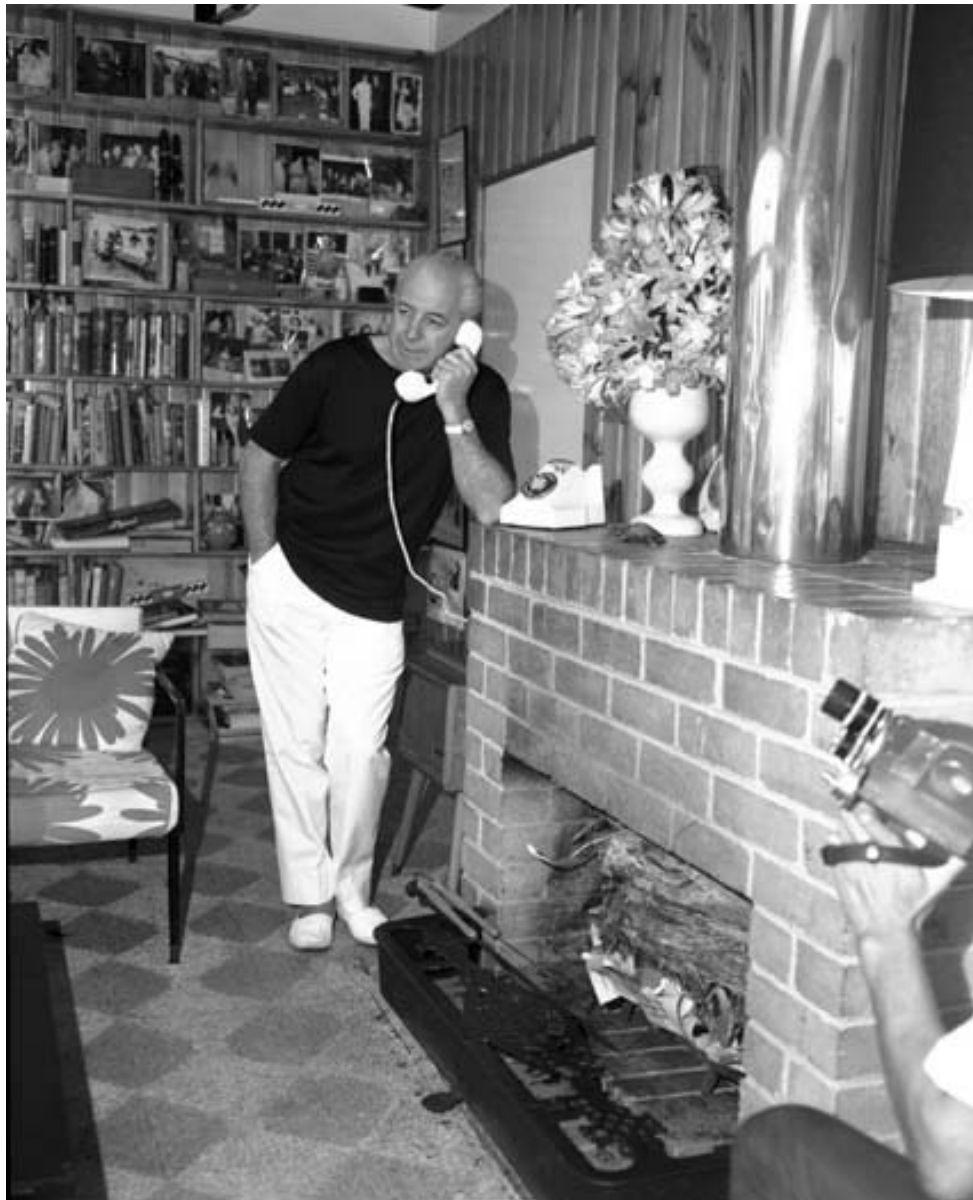
Harold Holt converses on the telephone at Portsea, Victoria, 1966.