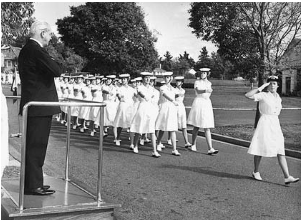
Prime Minister Harold Holt reviews a march past of WRANS to mark the raising of the new ensign, HMAS Harman, Canberra, March 1967.