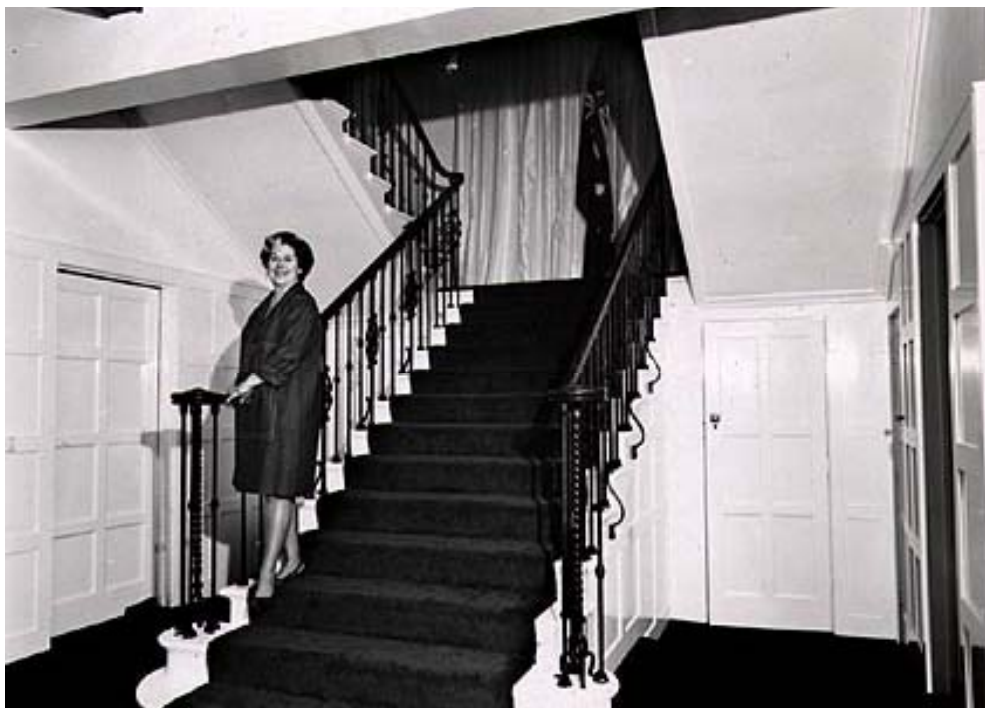
Zara Holt at the foot of the stairs in The Lodge, Canberra, 1966.

After Harold Holt's disappearance, Zara Holt took an extended overseas trip, which included the Memorial Service at Westminster Abbey, lunch with the Queen, a personal visit to the White House, and the laying down of the keel of the USS destroyer Harold E Holt . Zara Holt was created a Dame (DBE) in June 1968 and later that year also published her memoirs, My Life and Harry: An Autobiography .