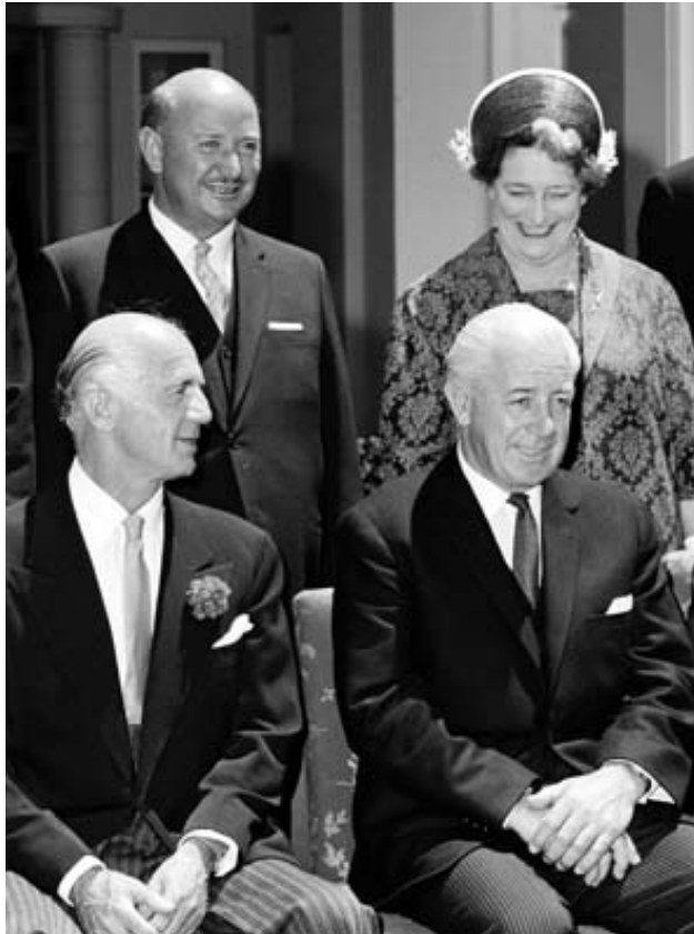
The Holt ministry swearing-in, Government House, Canberra, 26 January 1966.

On 20 January 1966 Sir Robert Menzies announced his retirement. Holt was elected to replace him. He was characteristically pleased that he had climbed over 'no dead bodies', as he put it. Holt's first ministry included newcomers Malcolm Fraser and Dame Annabelle Rankin, Australia's first woman responsible for a federal department.