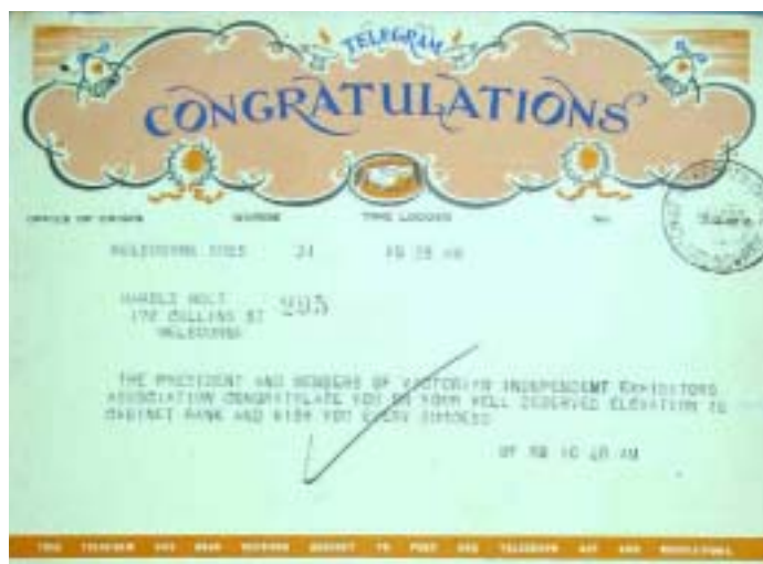
Congratulations message from the Victorian Independent Exhibitors Association, 1939. NAA: B3229, 5