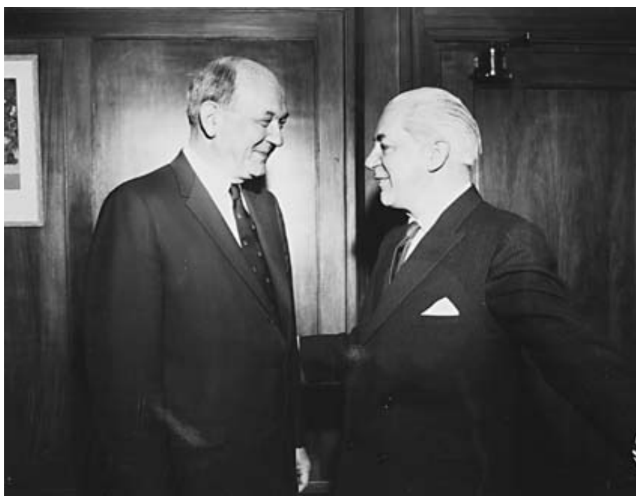
Harold Holt greeting Dean Rusk at SEATO Conference, 1966.