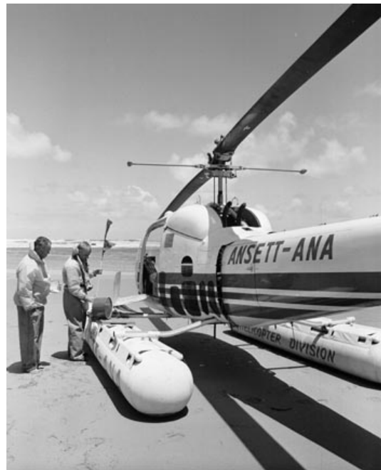
Search for Harold Holt, Portsea, 17th December 1967.

At 10pm on 18 December 1967, after an extensive search, the Governor-General, Lord Casey announced he would terminate Holt's commission as Prime Minister. The following day, John McEwen was sworn in as Prime Minister and three days later a memorial service was held in St Paul's Cathedral, Melbourne, attended by Prince Charles, Harold Wilson, President Johnson and many of the Asian leaders whom Harold Holt had visited in the previous two years. Around the world, services were held at Australian diplomatic missions, in New York and Washington – and, early in 1968, at Westminster Abbey.