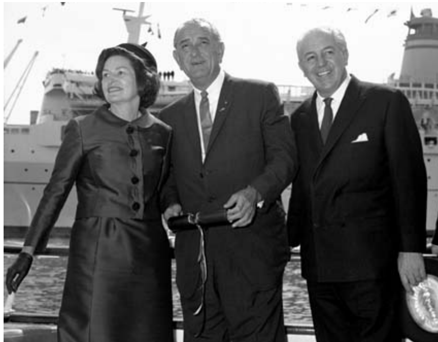
Prime Minister Harold Holt with US President Lyndon Johnson and Lady Bird Johnson during their Australian visit, October 1966.

After the Budget (McMahon's first) Holt set off to London for the Prime Ministers' Conference. President Johnson's visit to Australia on 20–22 October, en route to the Seven Nation Conference on Vietnam in Manila, highlighted the reality of the US alliance and contributed to an additional ten-seat majority in Holt's election win in November. Holt's return visit to the Johnsons at Camp David in mid-1967 underlined the leaders' personal compatibility and the strength of the strategic alliance.