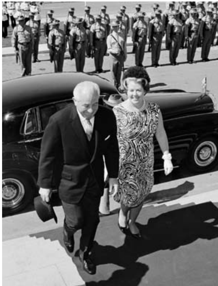
Harold and Zara Holt arriving at Parliament House for the opening of the 26 th Parliament, 1967.

Holt's term as Prime Minister was cut short by his disappearance on 17 December 1967 when he did not return from a swim in heavy surf off Cheviot Beach, Portsea. As Prime Minister his contribution to the nation had been significant, witnessing as it did a shift in the Australian ethos from a British Commonwealth emphasis to an Australasian one.