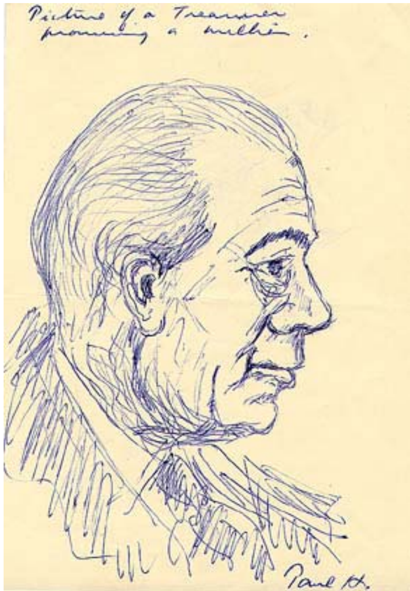
Pen sketch of Harold Edward Holt by Paul Hasluck, 1959.

CORRESPONDENCE FILES MAINTAINED BY HAROLD EDWARD HOLT, 1959-67