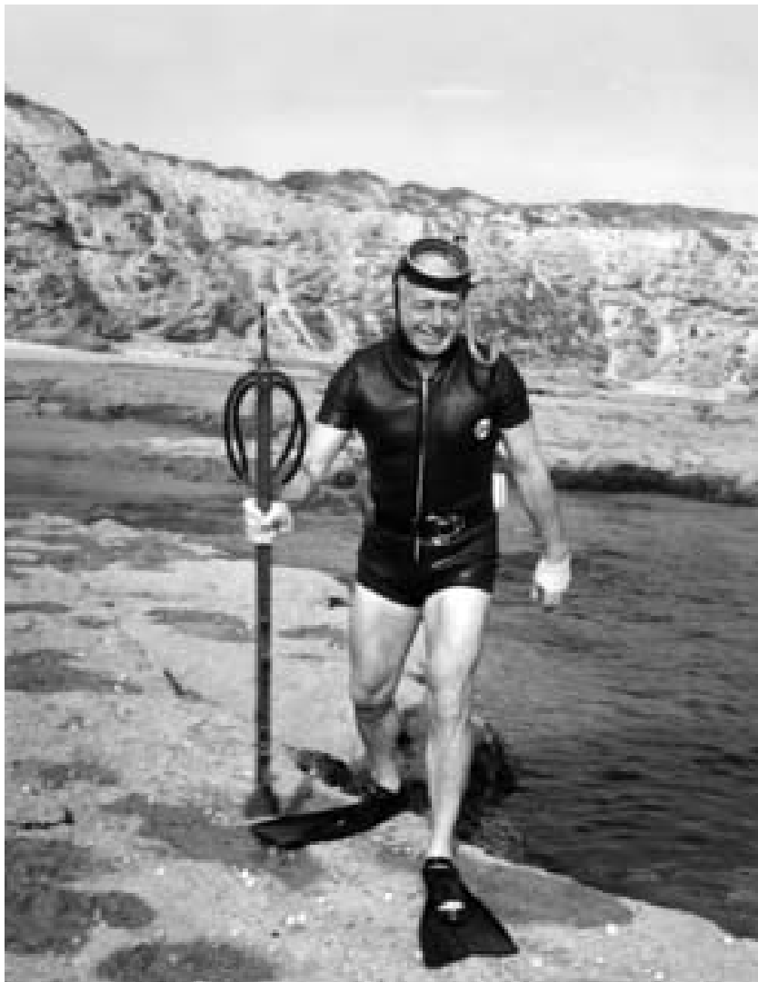
Prime Minister Holt at Portsea, Victoria in 1966, where he was later to disappear while swimming in heavy seas.